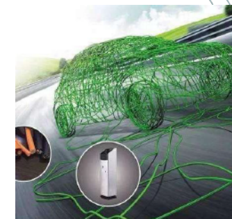
New Energy Vehicle